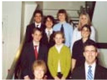
Budding Lawyers from Summit Country Day

Ripley Union, Summit Country Day, Western Brown, and West Union High Schools.