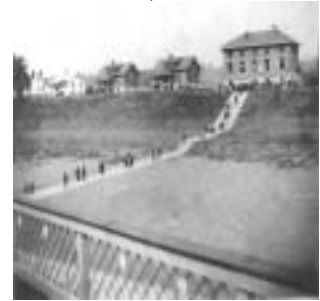
1925 Dedication of Chilo Lock #34

The Clermont County Park District is pleased to announce that the Chilo Lock #34 Visitor Center and Museum will officially open its doors on Saturday, August 27, 2005. The official dedication and ribbon cutting ceremonies will take place at 11 am. The visitor center and museum is located at Chilo Lock #34 Park, in the former operations building. Several guest speakers will be on hand throughout the day giving presentations on the history of riverboats, locks and dams on the Ohio River.